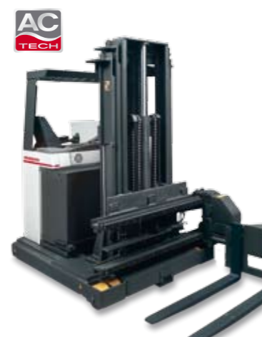
URF 1.2 - 1.5 tonne, AC