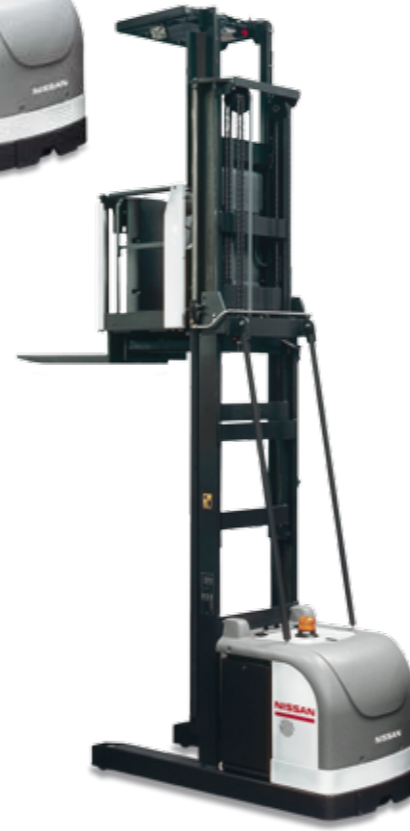
OPH OPC OPS 1.0 tonne, DC