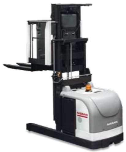
OPM 1.0 tonne, DC