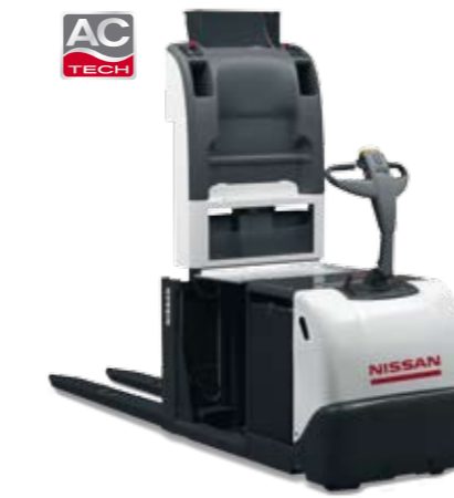
PPC/PPD 1.2 - 2.0 tonne, AC