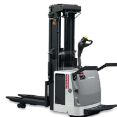
TS 1.2 - 1.4 tonne, DC