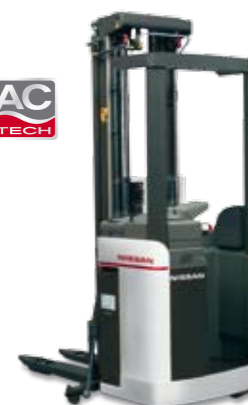
AJN/ASN 1.6 - 2.0 tonne, AC