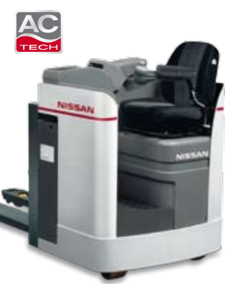
XLL 2.0 tonne, AC