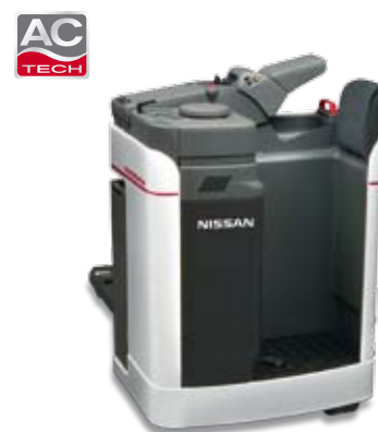
ALL 2.0 tonne, AC