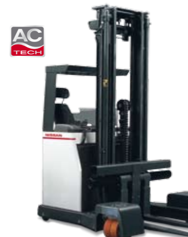
UFS 2.0 - 2.5 tonne, AC