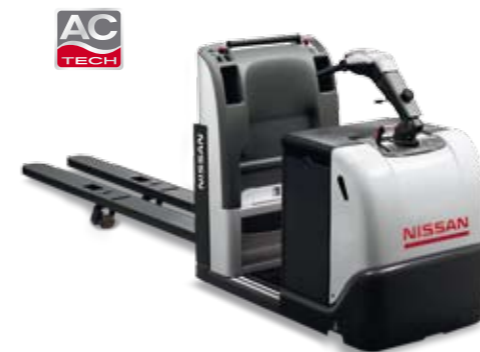
PPF/PPL 1.2 - 2.0 tonne, AC