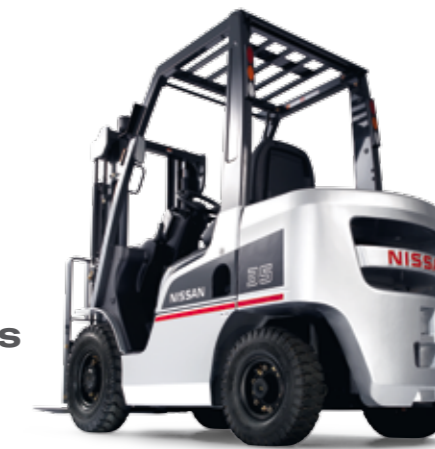
LX35 Series 3.5 tonne, Gasoline, LPG & Diesel