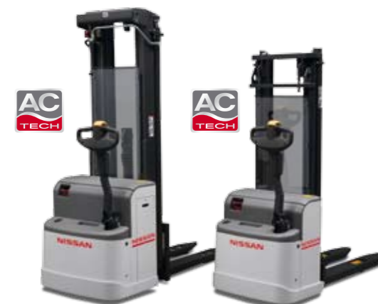
PSH 1.6 - 2.0 tonne, AC