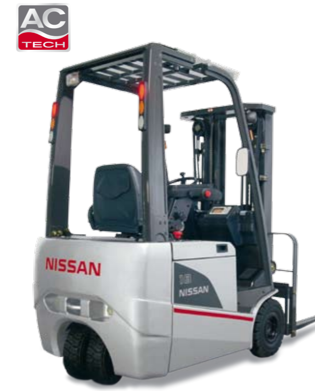
TX Series 48 volt 1.25 - 2.0 tonne, AC