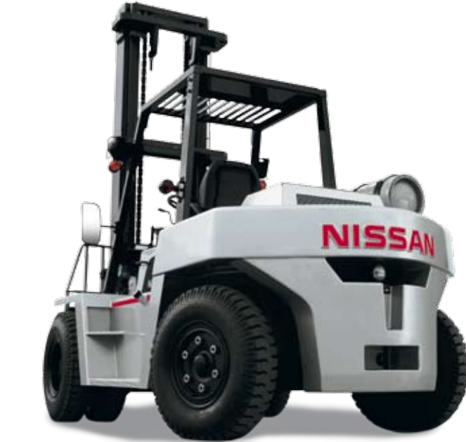
FX5 Series 5.0 - 7.0 tonne, LPG & Diesel