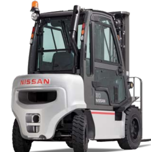
DX Series 1.5 - 3.2 tonne, LPG & Diesel