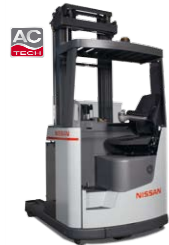
UNS/UHS 1.4 - 1.6 - 2.0 - 2.5 tonne, AC