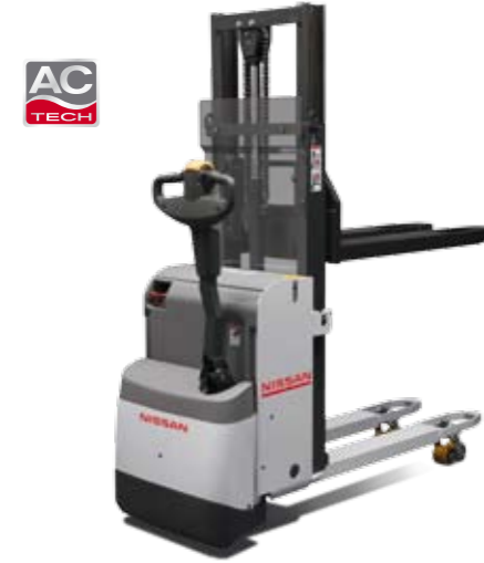
PSL/PSD 1.2 - 1.6 tonne, AC