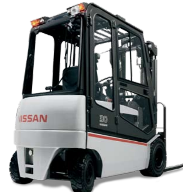
QX Series 80 volt 2.0 - 3.0 tonne, DC