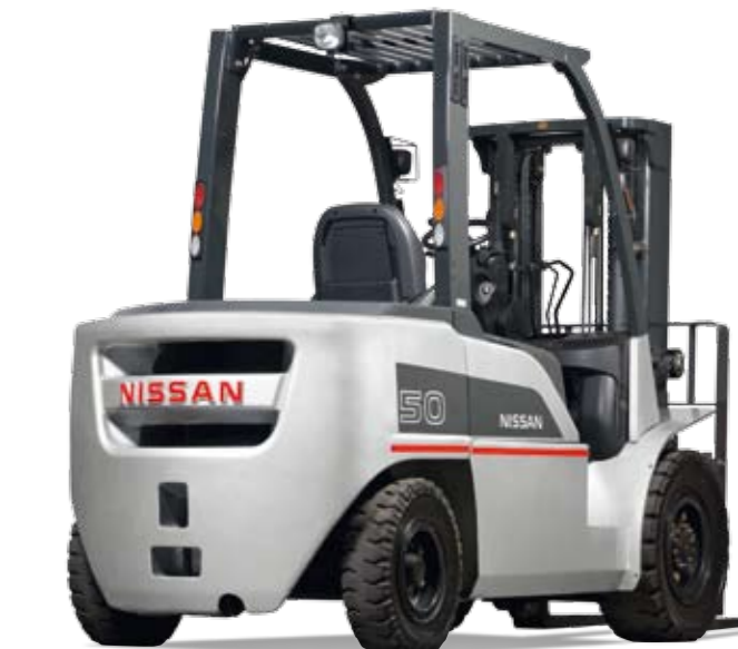
GX Series 3.5 - 5.0 tonne LPG & Diesel