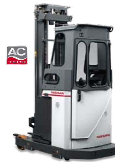
USS 1.4 tonne, AC