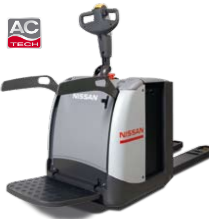
PLP 2.0 - 2.5 tonne, AC