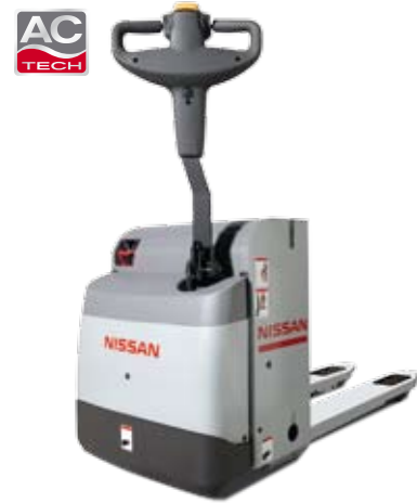
PLL 1.4 - 2.0 tonne, AC