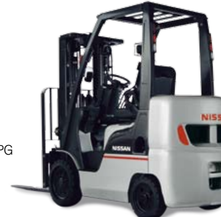
LX Series 1.5 - 3.6 tonne, Compact cushion LPG 1.6 - 2.5 tonne, Compact pneumatic Gasoline & LPG Dual fuel