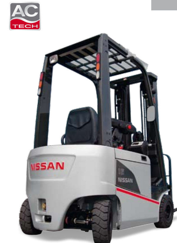
TX4 Series 48 volt 1.6 - 2.0 tonne, AC