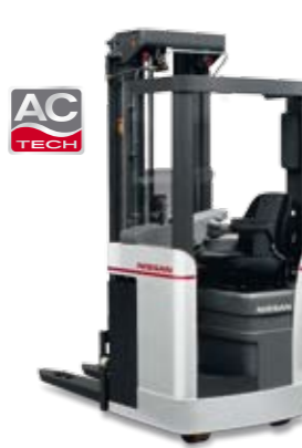
XJN/XSN 1.6 - 2.0 tonne, AC