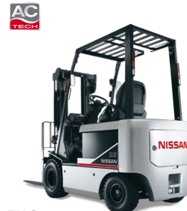
BX Series 48 volt 1.5 - 3.0 tonne, Cushion AC 1.5 - 2.5 tonne, Pneumatic AC